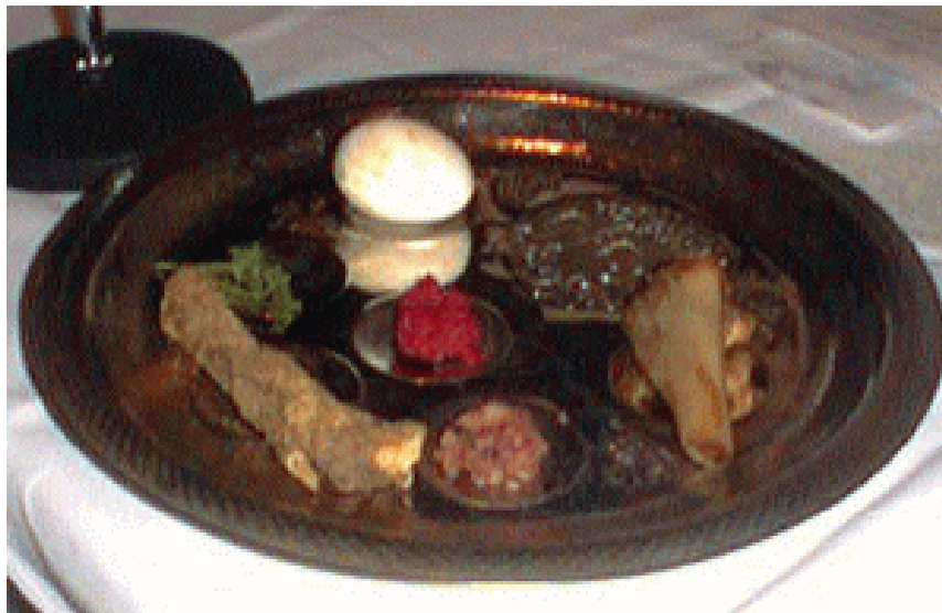
The Pesach (Passover) Seder Plate (for the Pesach Meal)

Understanding the Passover (Pesach) Season