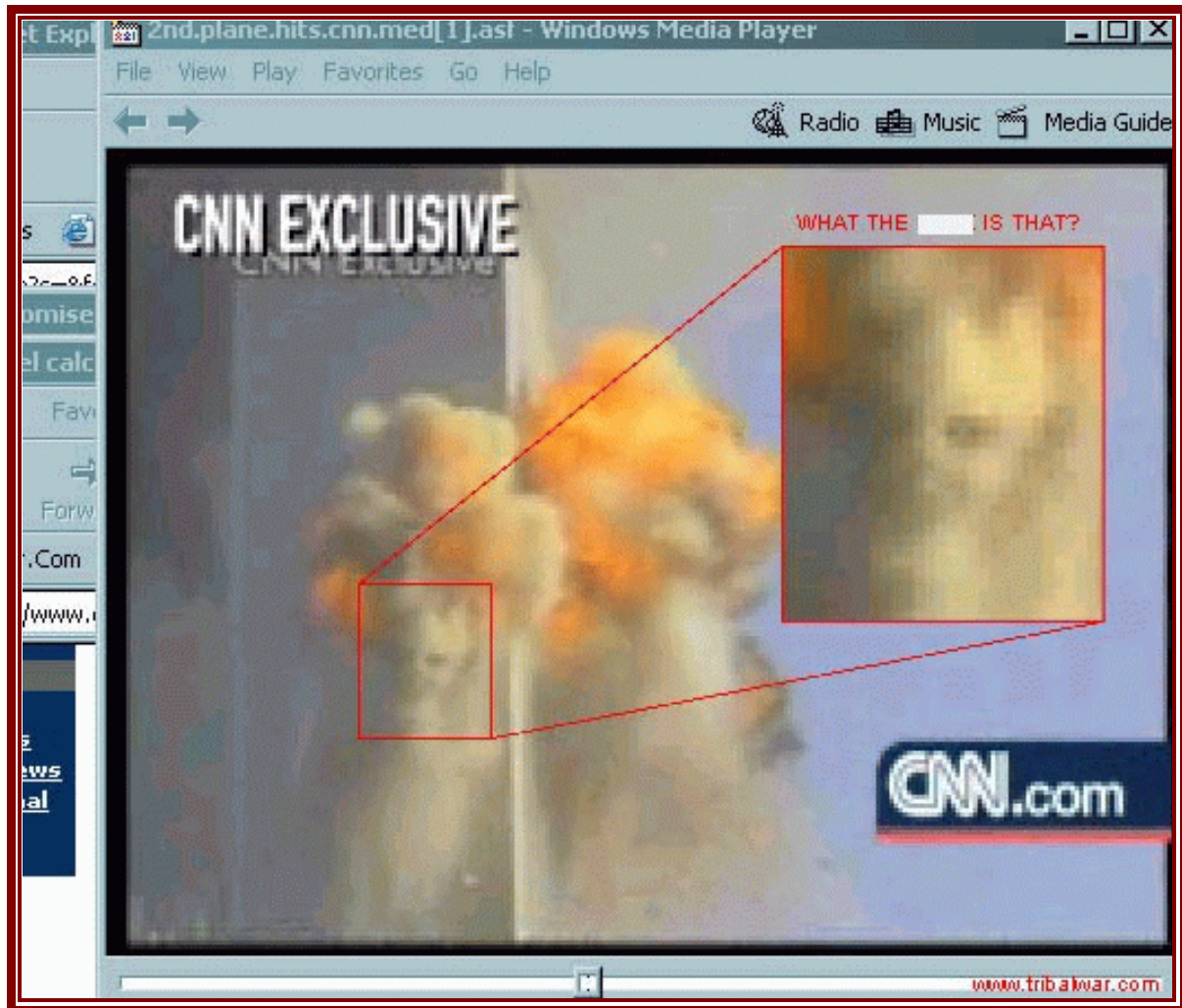
Figure 1: Face At Impact Of Second Aircraft

This morning, Thursday 20 September 2001 i received an email with the following photographs attached.