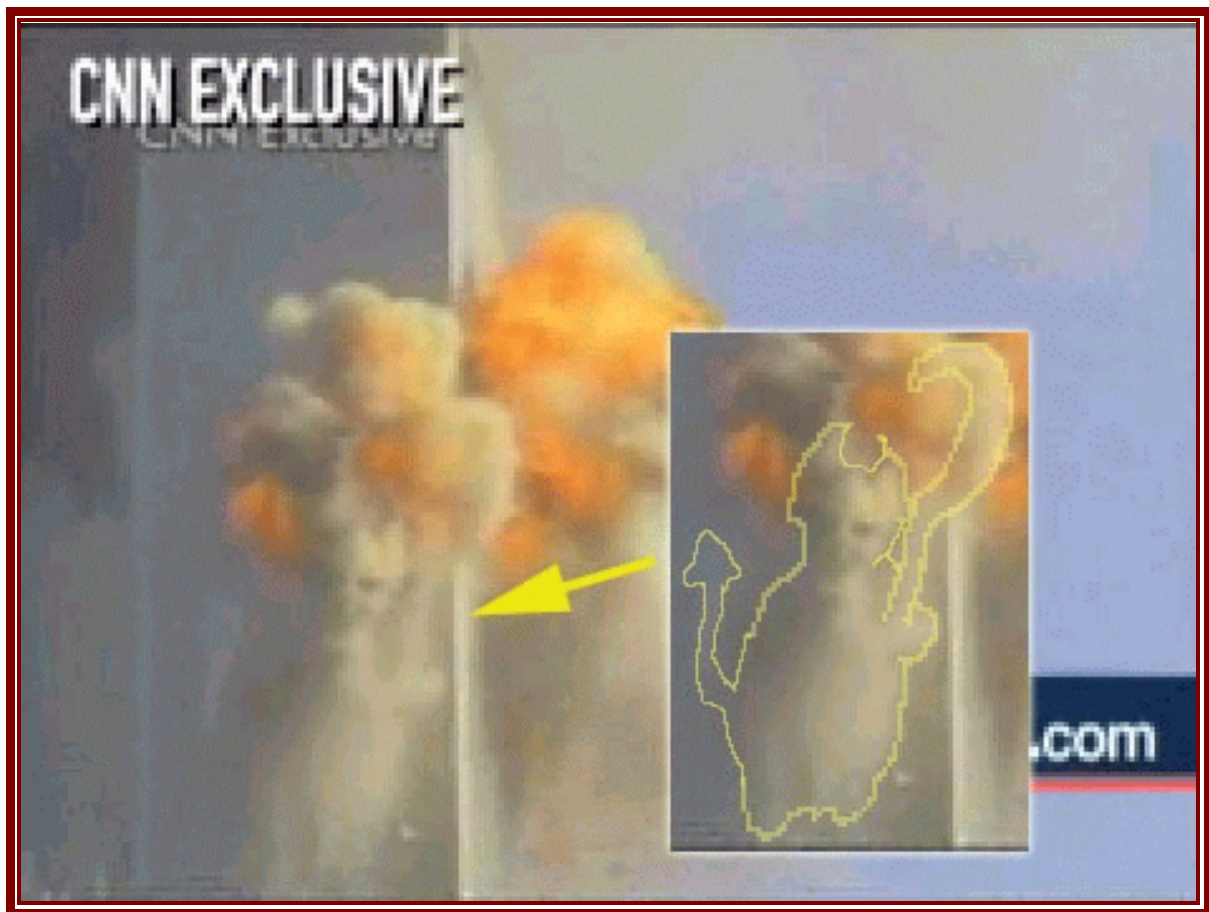
Figure 2 : Outline Of Satanic Form

In the smoke, flame and dust of the explosion there appears to be a face with horns. This is highlighted with a red rectangle and enlarged in the top right of the image with the caption "What the (expletive deleted) is that?"